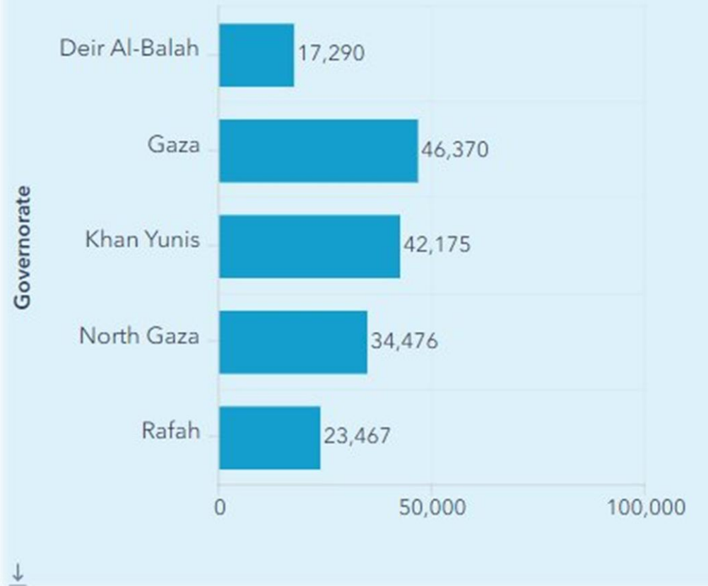
Damage count by Governorate [6 September 2024]