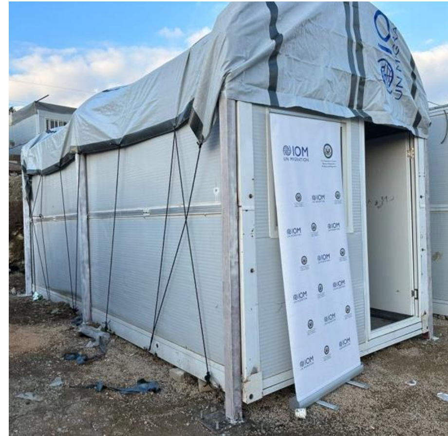
Foldable container upgrade (metal skeleton) pilot by IOM. Kirikhan – Hatay