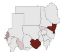
Targeted HouseHold per State