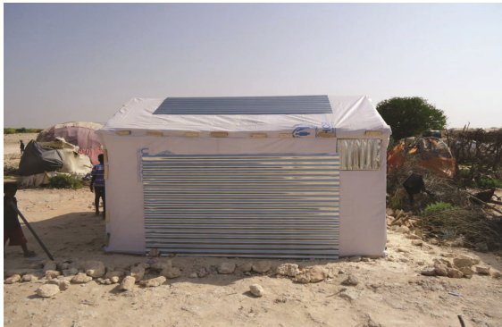
PICTURE OF POSSIBLE UPGRADE