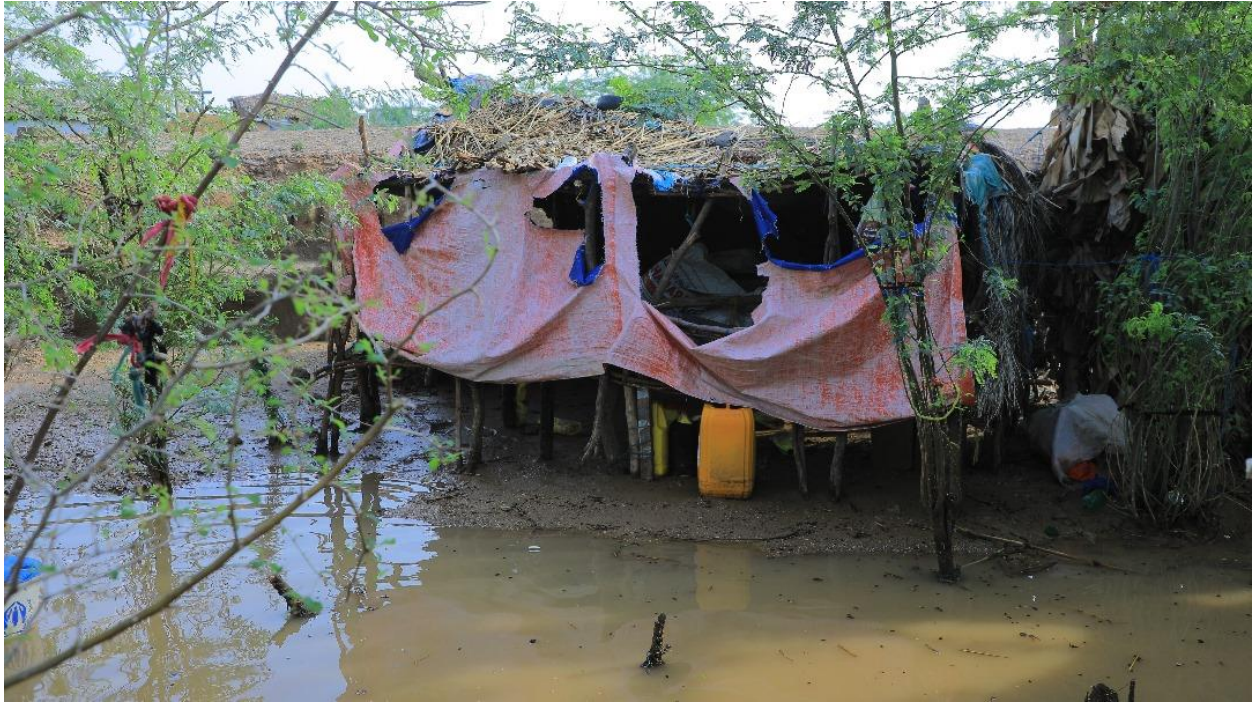
Family in a makeshift shelter experiencing additional flooding shocks in Abs district, Hajjah Governorate.