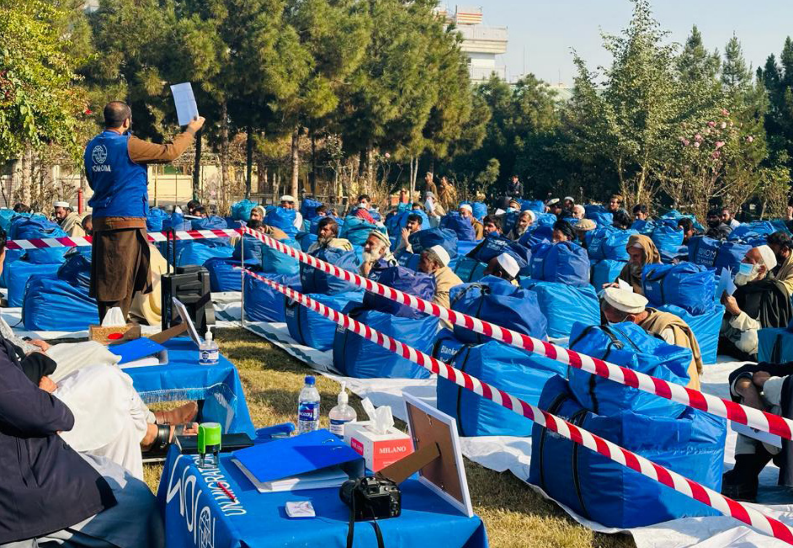
Winterization distribution in Nangarhar . Photo taken by IOM , December 2022