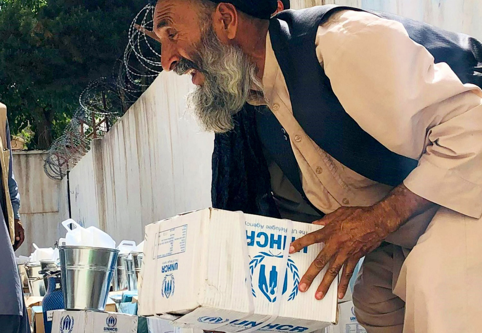
NFI distribution in Herat province in May 2022