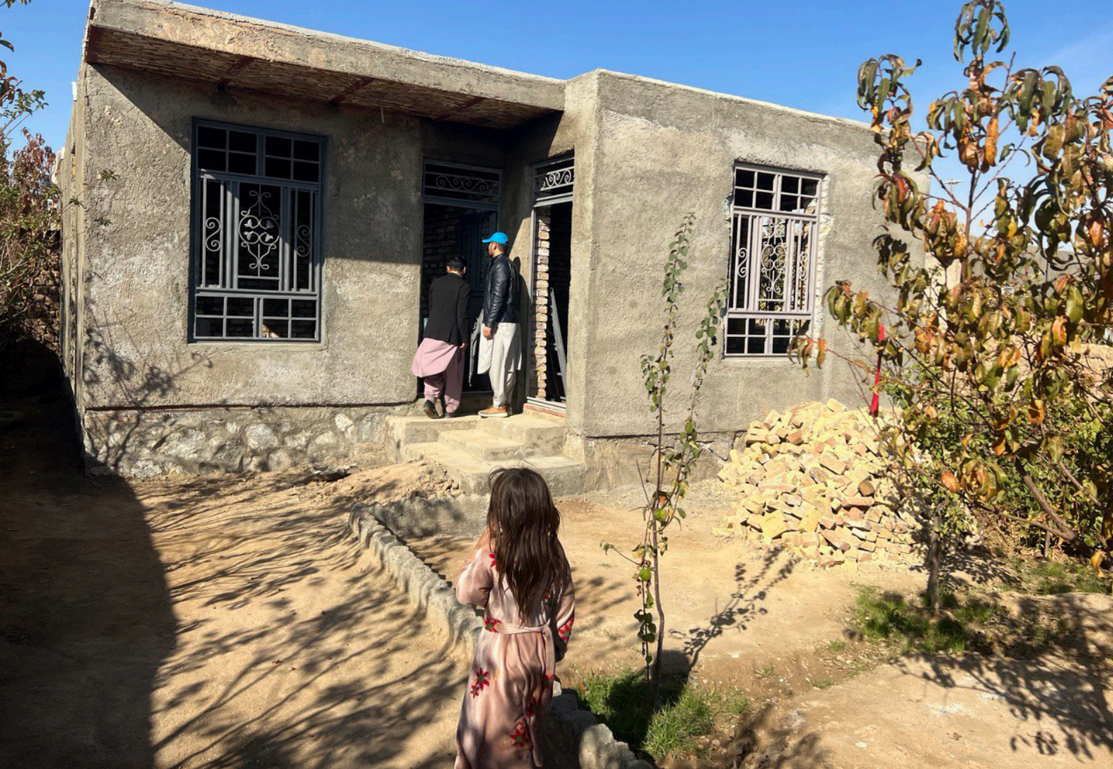
Monitoring of Transitional Shelter in Guzara district . November 2022