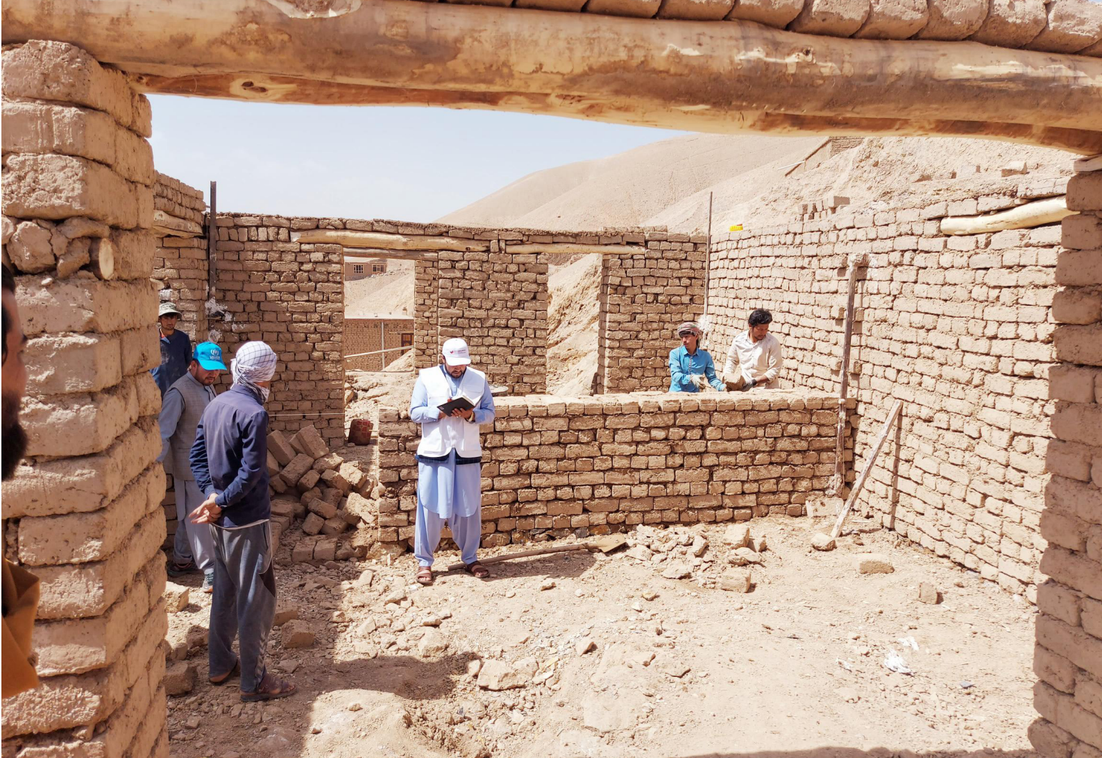
Monitoring of Transitional Shelter in Bamyan province . Photo taken by shelter Cluster , September 2022