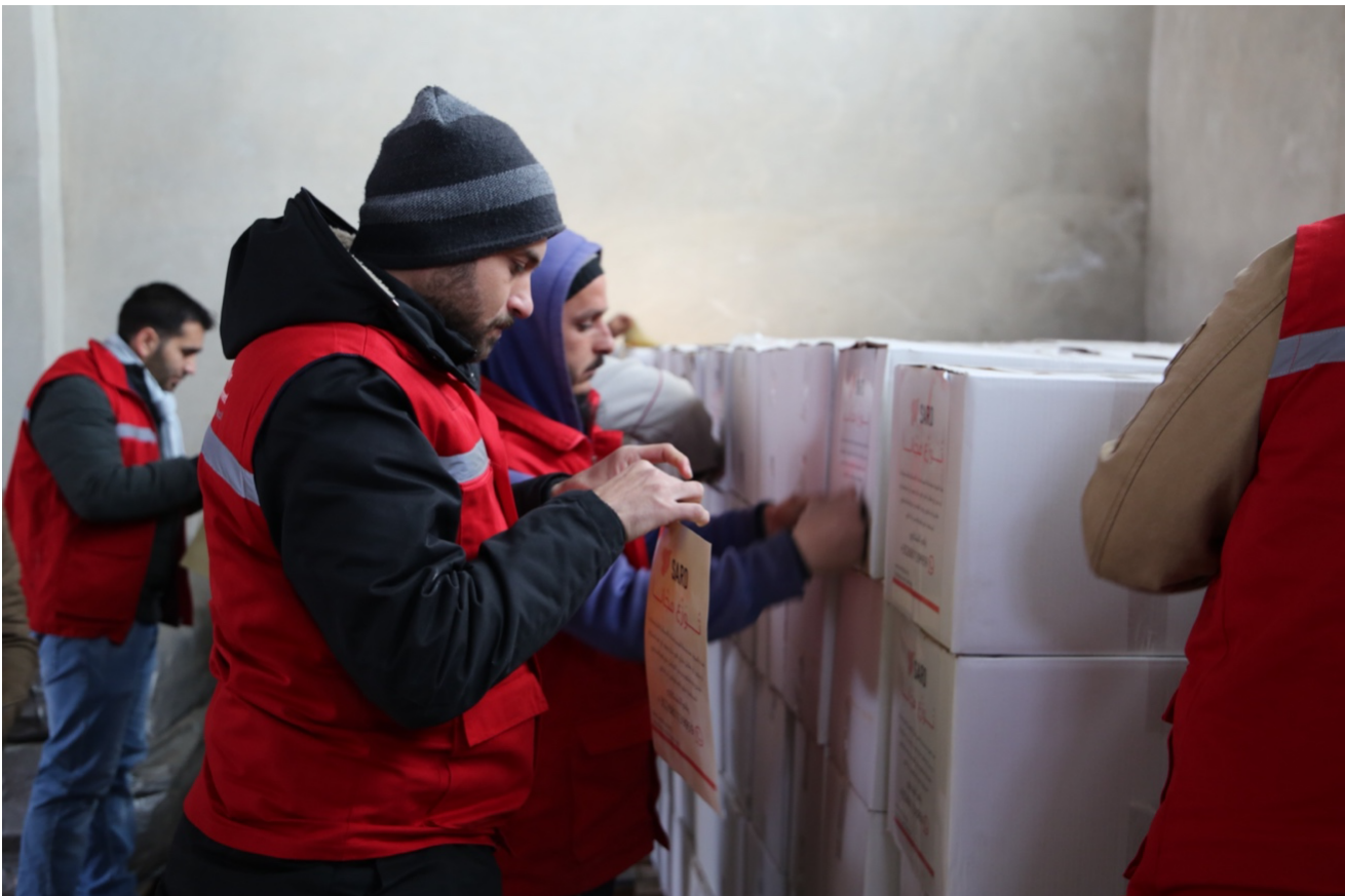
SARD Warehouse, Preparing Ready to Eat Rations