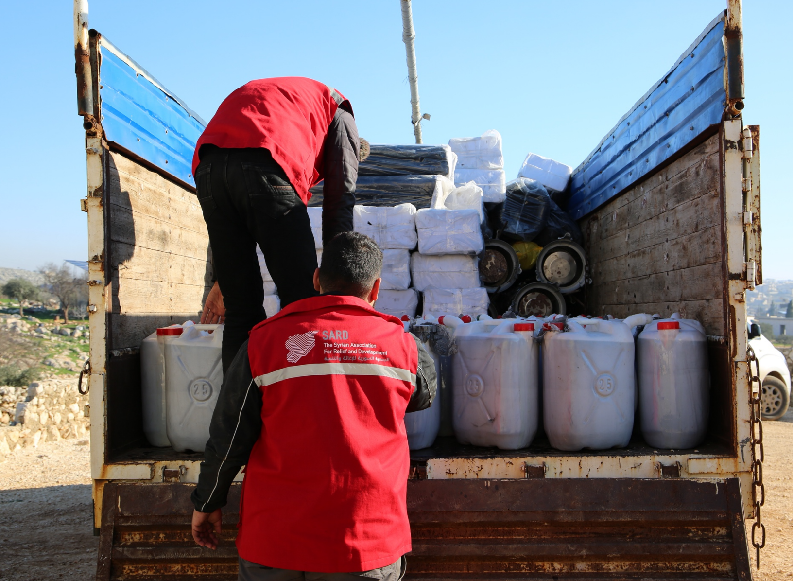
Termanin, Distributing round of fuel