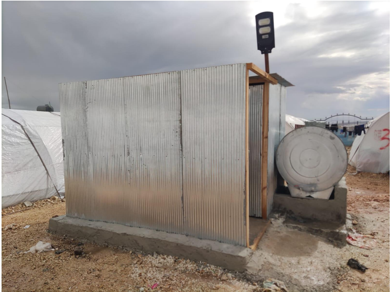
Latrine installation in Sarmada, Kamuna, Noor settlement