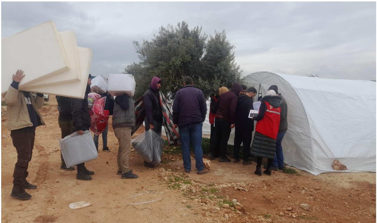
Sarmada, Kamuna, Noor settlement