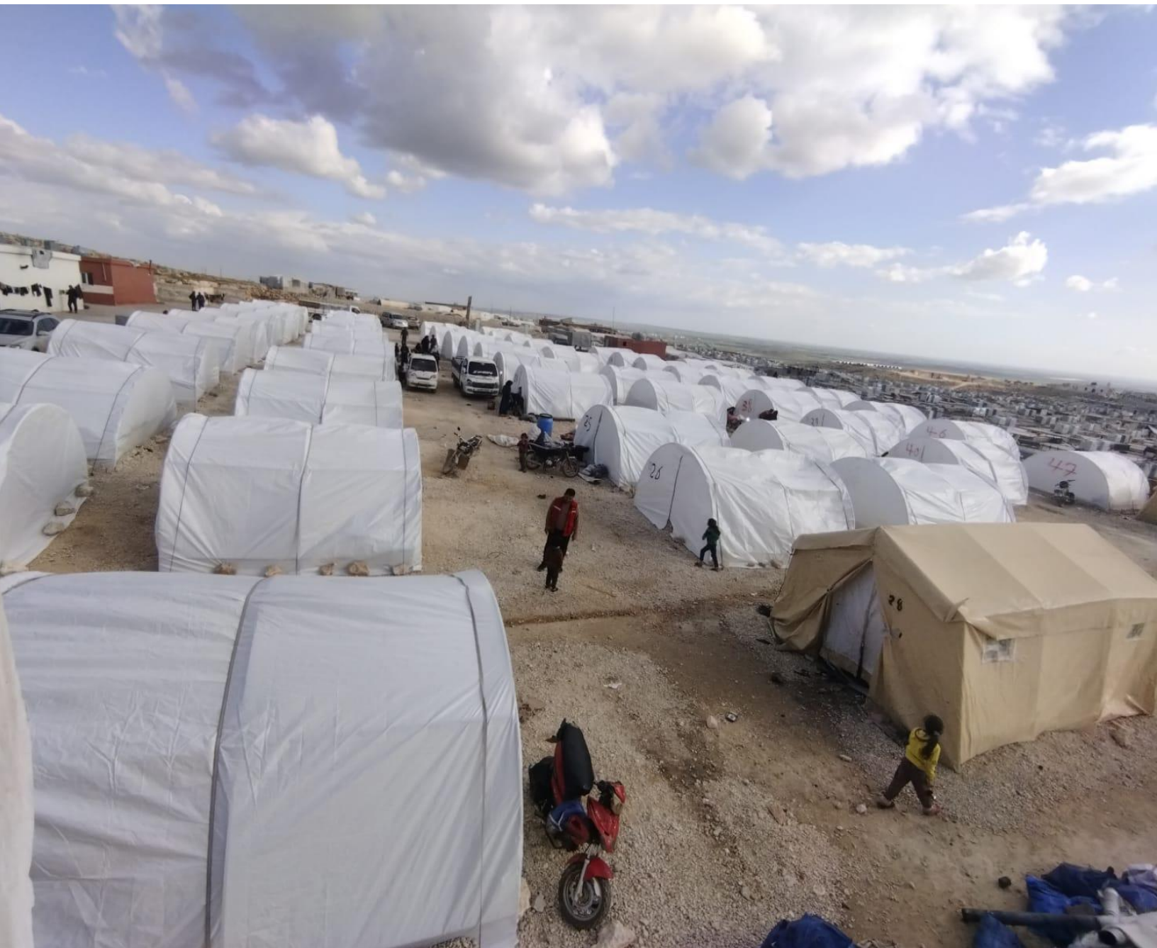
Sarmada, Kamuna, Noor settlement