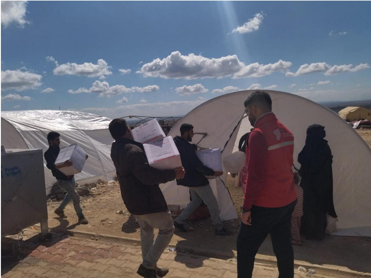
Sarmada, Kamuna, Noor settlement