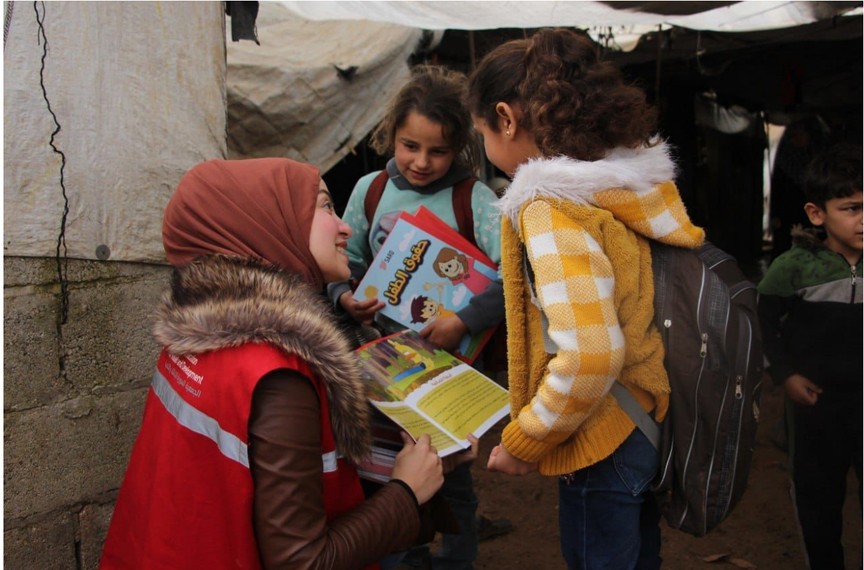
A SARD employee hands out a SARD IEC children's magazine about the rights of children and cholera prevention

A total of 225 child protection cases that were already followed by SARD prior to the earthquake have been visited after the earthquake.