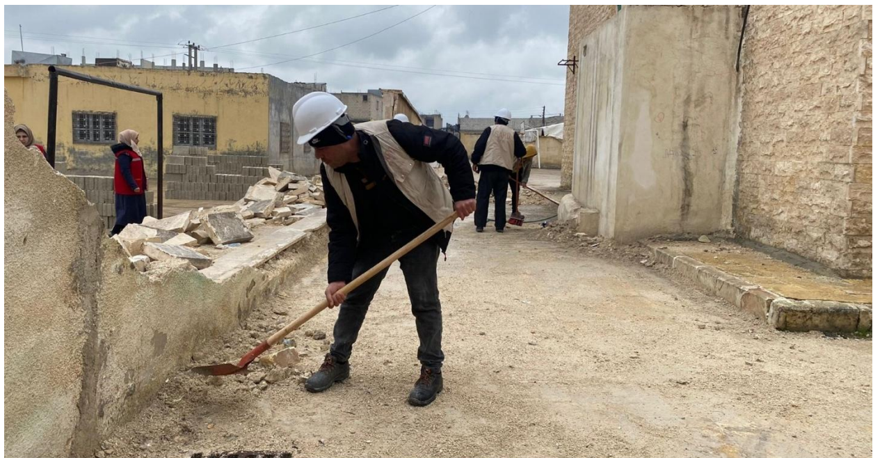
SARD CFW workers carrying out light rubble removal