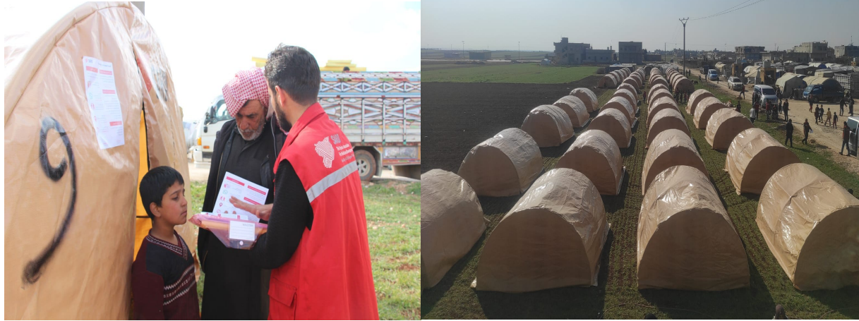
Dahiat Sejjo, A'zaz