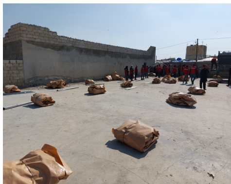
SARD premises in Azaz'

After the second earthquake ( 2th Feb), additional 14 families got their house damaged and unsecured to use , SARD we also provided 14 tents for 14 members. The 14 tents were installed in the SARD premises and will be used until the staff is able to return to their home.