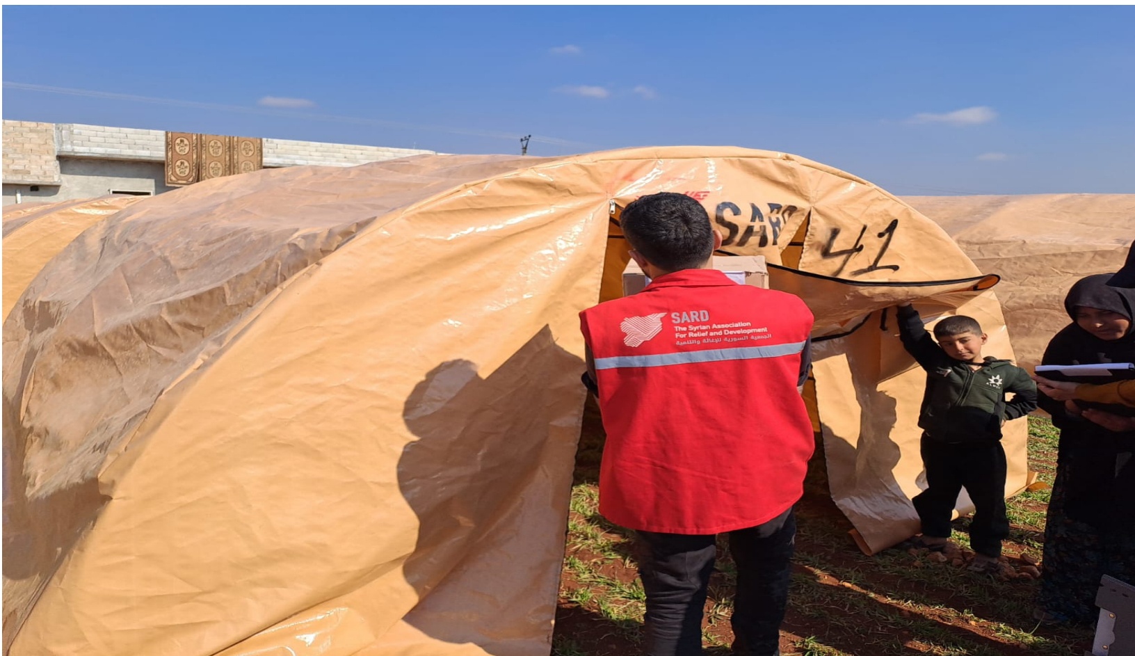
Kafra, SARD Photo