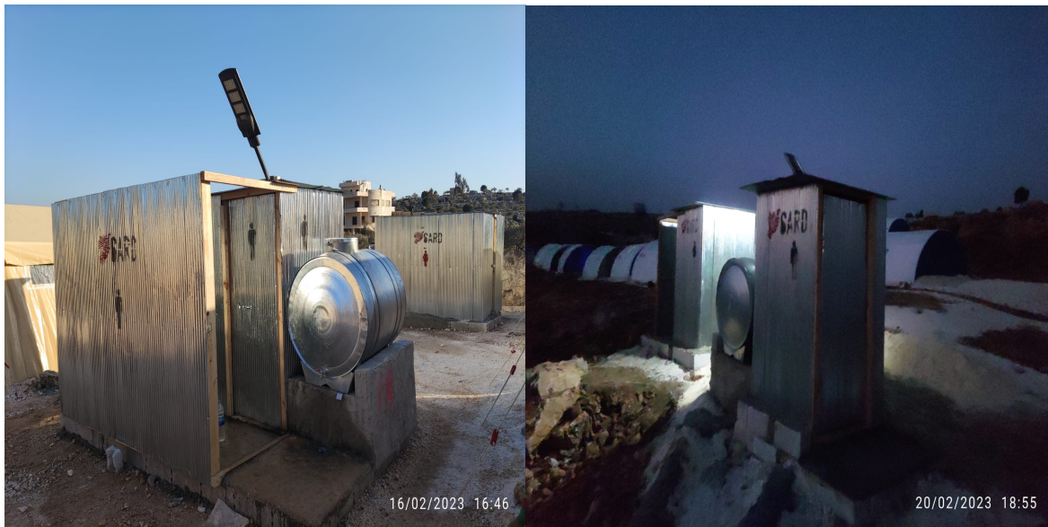
Latrine installation in Termanin

As such, since the beginning of the crisis, SARD has reached 50 families with multi-sectoral assistance and 91 families with emergency latrines. Some 35% of the private contribution to the earthquake response has been completed to date