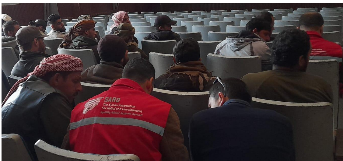
UNDP Cash for Work training in Jandariss