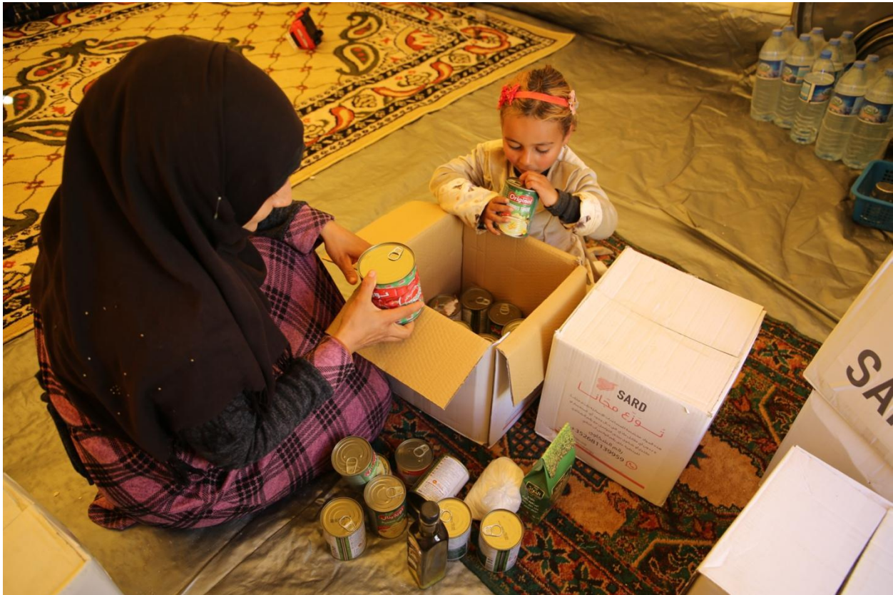
Mother and daughter unpacking an RTE