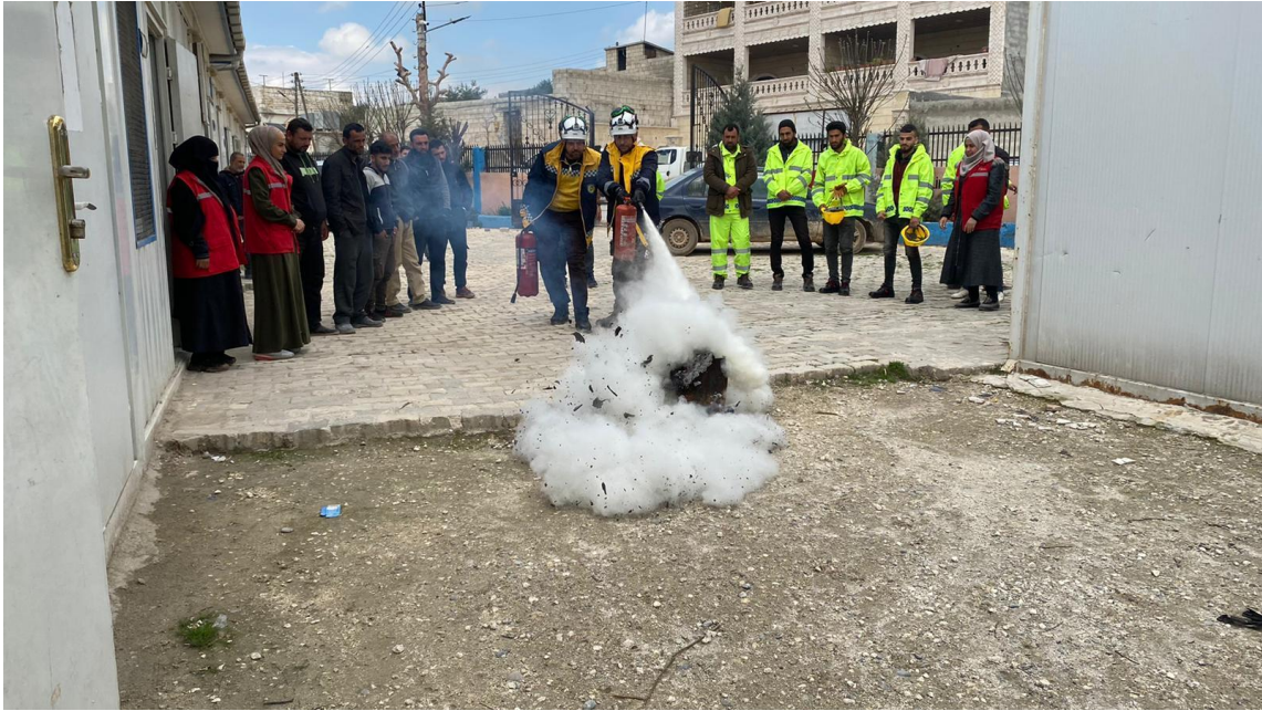
SARD in collaboration with Civil Defense trained 30 Cash for Work workers under OCHA