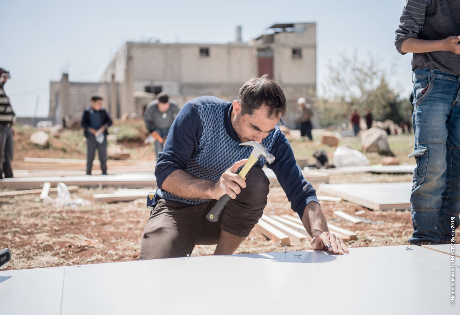
© Hameed Marouf / UN-HCR / Syria (2018)