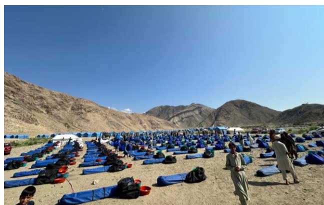
Tent and NFI provision at Zirai Baba settlement

Emergency Shelter and NFI: Cluster partners have provided 1,666 families with emergency shelter materials, including tents and tarpaulins, and 1,486 families with Emergency Shelter Repair Tool Kits (EKS) across the affected areas. Standard NFI kits, winter clothing kits and blanket modules have been distributed to 1,486 families. The Cluster reports a remaining capacity of 18,056 shelter materials, 8,350 EKS, 22,490 NFI kits, 6,700 blanket modules, and 33,596 winter clothing kit which can be made available for distribution based on outcome of ongoing needs assessments.