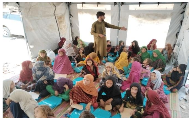
Distribution of temporary learning materials to affected girls in Khas Kunar Camp.

Education: Cluster partners report damage to 85 community-based education classes and 67 schools damaged or destroyed, along with damage to sanitation infrastructure. UNICEF provided 7 high-performance tents (HPTs) with recreational kits for integrated child-friendly and temporary learning spaces Dewagal Valley of Chawkai District (4) for 160 children and in Khas Kunar Camp for 120 children (3). A further 10 HPTs are about to be set up across Nurgal and Chawkai districts in line with outcomes of needs assessments. A further 20 HPTs have been dispatched from Kabul to Kunar for distribution with an additional 20 HPTs on standby in Nangarhar province. SCI in partnership with CoAR is operating temporary learning spaces in Chawkai and Nurgal districts of Kunar Province and Khas Kunar Districts of Khas Kunar Province covering 1,940 earthquake-affected children. CiC is planning to provide six months of mental health and psychosocial support (MPPSS) and to establish child-friendly spaces across Kunar Province, targeting 18,000 people (80% children, 10% care givers and 10% teachers).