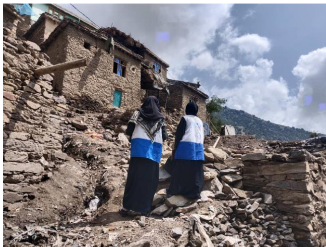
Female enumerators during a joint needs assessment in Chawkay District.

Khas Kunar Camp and Nangarhar Province to provide safe care for UASC. A total of, 35 social workers (17 females) have been deployed to hospitals and affected areas to provide case management services and community work. A dedicated child protection hotline for children has been established to complement the widely available Awaaz hotline. Cluster partners established 11 child-friendly spaces across the camps and 1,438 people (607 boys, 566 girls, 145 women, 120 men) were reached with MHPSS activities over 15,000 people, including care givers and teachers, received awareness messaging on child protection and well-being. Partners of the AoR on for Gender-based Violence (GBV) have reached 9,561 individuals across the affected areas with psycho-social support, awareness activities and referrals. UNFPA distributed 1,874 dignity kit across Chawkay District of Kunar Province and Kama and Jalalabad Districts of Nangarhar Province. Partners are further working to ensure the safety of women and girls in the established settlement and as well as to address hygiene and dignity needs of women and girls outside these camps.