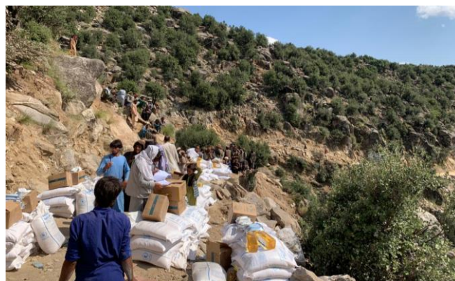
Distribution of food rations in Shumash village, Nurgal District.

Food Security and Agriculture: So far, Cluster partners assisted at least 60,827 people across the affected districts with high-energy biscuits for 22,134 people, one-month full-in-kind food rations for 15,245 people, and 23,448 cooked meals, distributed with priority to women, children, the elderly, people with disabilities, and other at-risk groups. The in-kind food rations include blanket supplementary feeding programme (BSFP) commodities, such as “Wawamum” for children under five and “Supercereal” for pregnant and lactating women, complementing the distribution of cooked meals.