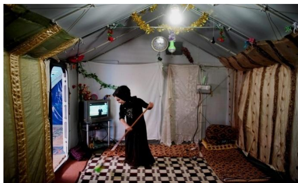
Figure 1 adaptation of RHU in winter

Gaza's winter brings heavy rain, runoff, storms, 5–10°C nights, and high humidity. RHUs should be adapted for waterproofing, heat retention, and wind resistance. All adaptation options have advantages and limitations depending on available materials and site conditions. It is recommended that these adaptations for cold climates are implemented in line with the thermal comfort upgrade options by Better Shelter available HERE .