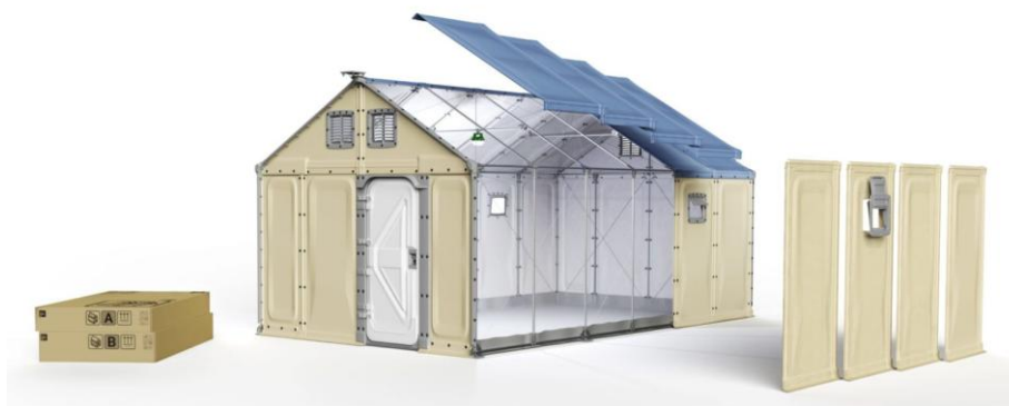
Figure 1: Relief Housing Unit.