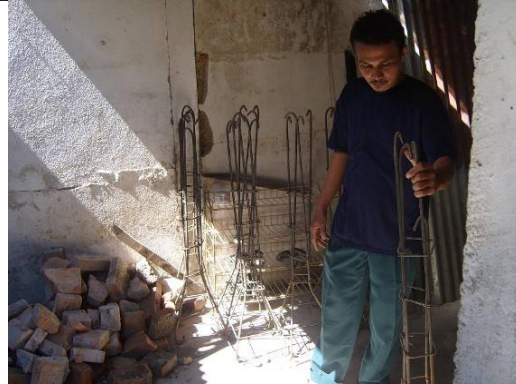
Photo: Community applied DRR training for rebuilding house