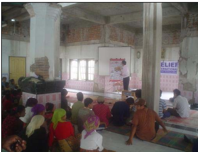
Photo: Community DRR Training at Kasai Village