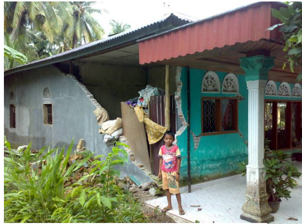
Photo: Beneficiary’s damaged house pre-reconstruction