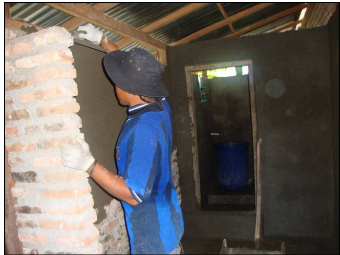
Photo: First stages of construction