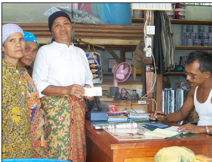
Photo: Exchanging voucher for construction materials