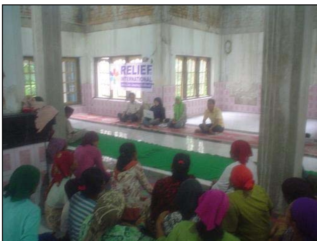
Photo: Voucher distribution and socialization