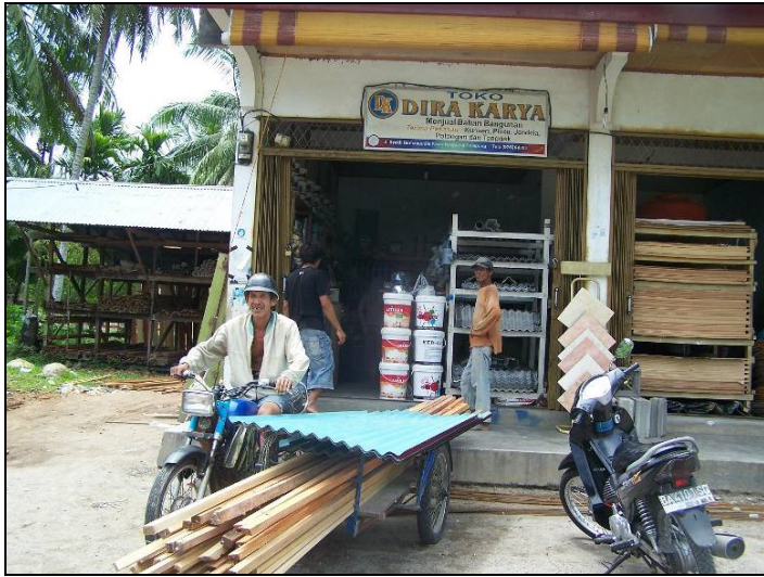
Photo: Retrieving and delivering construction materials