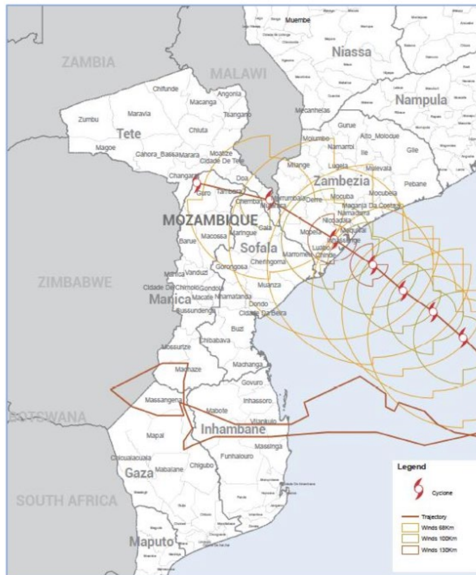
Figure 1: Severe Tropical Cyclone Freddy projected trajectory.