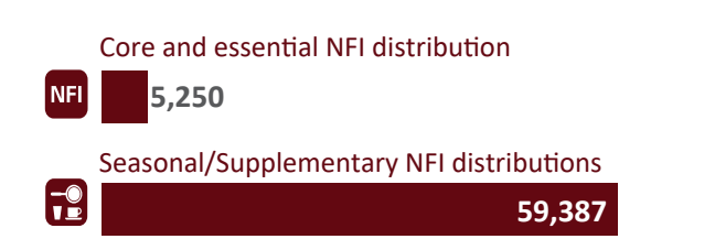
Trend analysis of people reached by NFI activity per month (2024-2025)