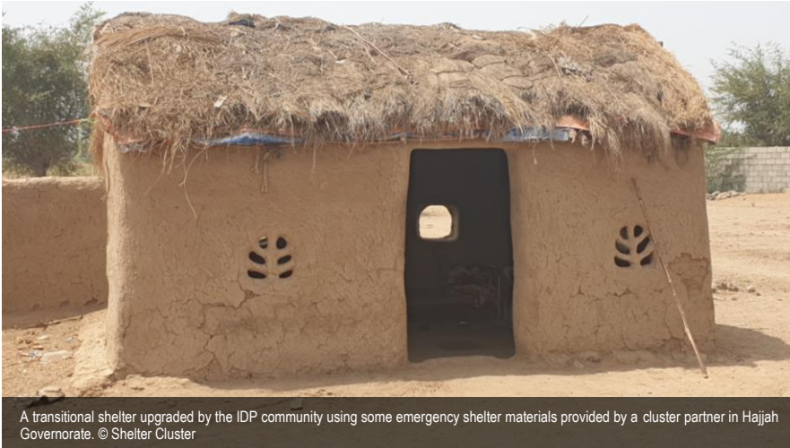
A transitional shelter upgraded by the IDP community using some emergency shelter materials provided by a cluster partner in Hajjah Governorate.