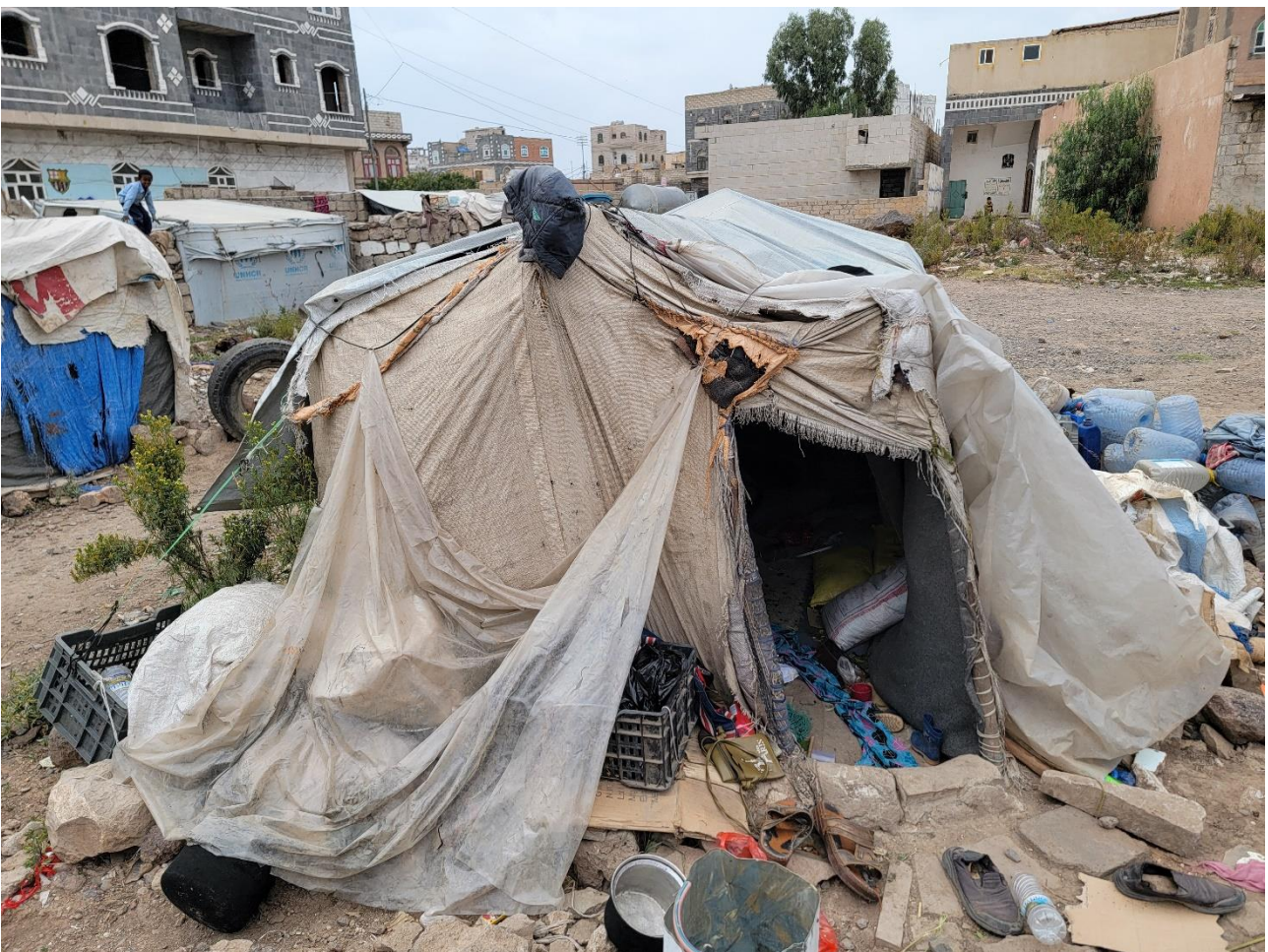
Al Thadamon IDP hosting site. Dhamar City, Dhamar governorate. @SDF