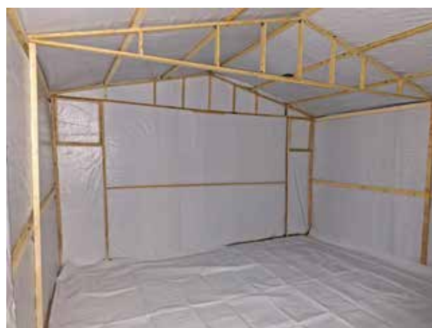
PHC/IOM local manufacturing of ESK