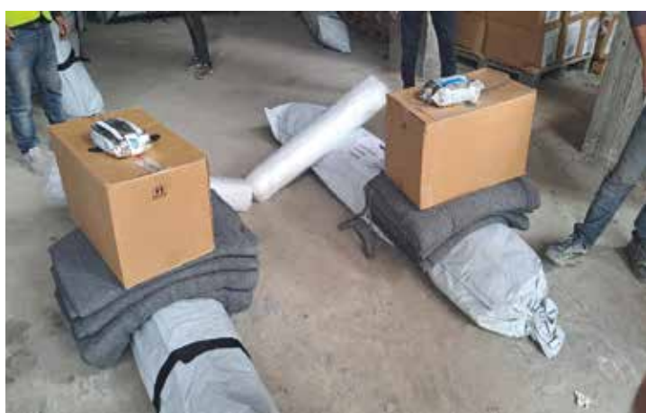
Joint distribution kits by shelter cluster partners