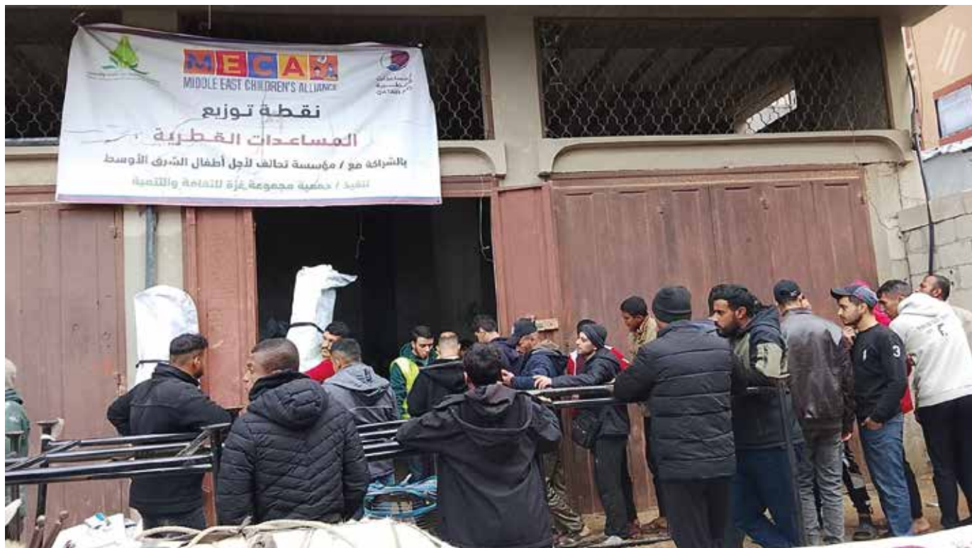
Joint distribution by shelter cluster partners – Photo from MECCA