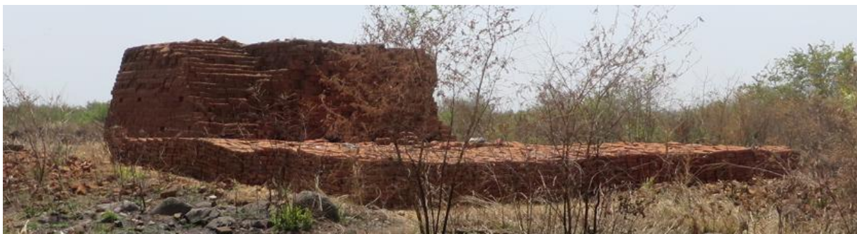
One of two small scale Brick kilns observed on the site.

No houses were observed onsite, but the survey was incomplete, and subsequently shelters were observed in satellite images. This requires further verification. Signs of previous occupancy and two brick kilns were observed in the site next to water courses.