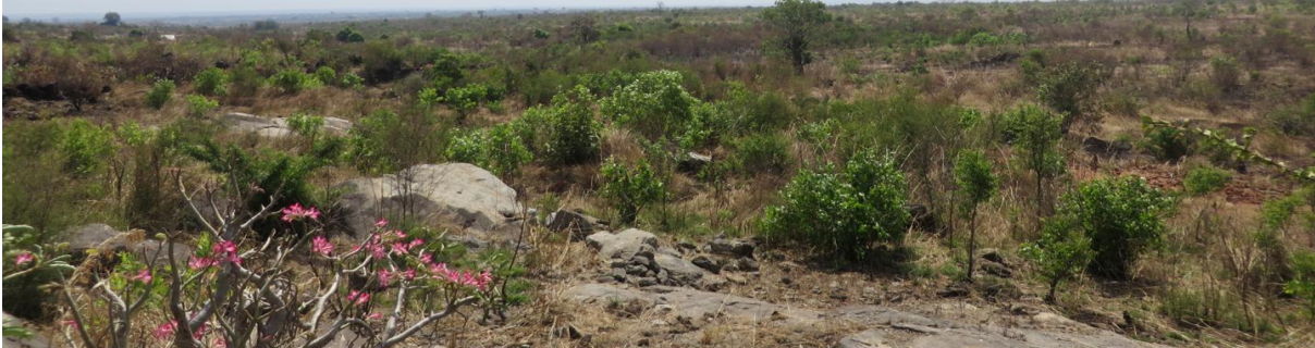
View south west across the site – showing a patch of bare rock in the foreground