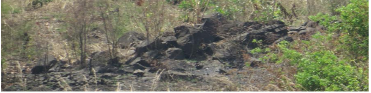
Example of a rocky part of the site where tent pitching will not be possible.