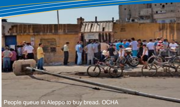
People queue in Aleppo to buy bread. OCHA

received for the regional refugee response plan