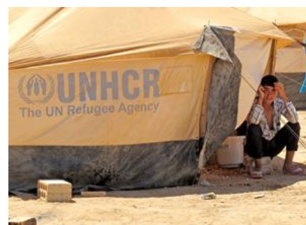
A Syrian refugee in Za'atari camp, Jordan.

Syrians are increasingly moving across the border to flee the intensifying violence, thus putting growing pressure on the receiving countries. More than 340,000 people have left Syria since the beginning of the conflict 19 months ago – over 37,000 during the last two weeks. The number of refugees is likely to double by the end of the year, according to UNHCR forecasts.