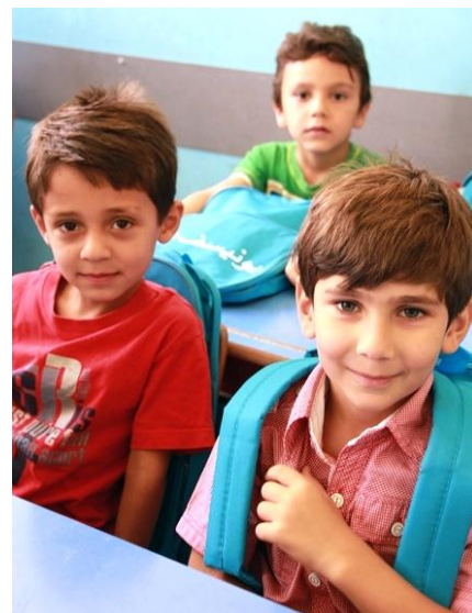
Credit: UNICEF/ Syria (Sep 2013). Students smile while wearing their UNICEF backpacks filled with school supplies.

The following number of adolescents received life skills and vocational-awareness training: 700 in al Hamra and al Wa'er regions in Homs, in cooperation with al Birr; 200 in Tartous shelters through a local NGO; more than 2,000 Palestinians in camps, including in Aleppo, Damascus, Dar'a, Hama, Homs and Lattakia, and in IDP shelters in Mazzeh area, Jaramana camp, Al-zahera area and in Rural Damascus (Al-Ramadan camp, Seada Zeinab camp, Qudsia area) through UNWRA; 300 in the adolescent-friendly spaces in Aleppo; 150 in Damascus, in cooperation with the Ministry of Religious Affairs; and 150 in cooperation with the Ministry of Environment and the Ministry of Education. Also, 640 children and adolescents received art and recreational activities in Damascus shelters, in coordination with the Ministry of Culture.