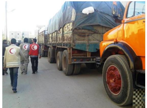
Al Qaryatayn, Homs, Syria (29 Oct 2013) - SARC collaborates with the UN-led joint humanitarian convoy to deliver humanitarian assistance adequate to meet the needs of the estimated 40,000 people who fled fighting in Mahin to Al Qaryatayn in Homs.

On 24 October, the UN Hub–Homs team dispatched a joint humanitarian convoy of 10 trucks carrying 465m 3 of relief cargo on behalf of IOM, UNFPA, UNICEF, WFP and WHO to Talbiseh, which hosts an estimated 150,000 displaced people, and which last received assistance via a joint humanitarian convoy in May 2013. Accompanying SARC Homs until the last Government checkpoint, the UN/SARC team ensured dispatch of the following life-saving supplies: food for 20,000 people; NFIs for 20,000 people; WASH items for 20,000 people; and medicines for 36,800 people.