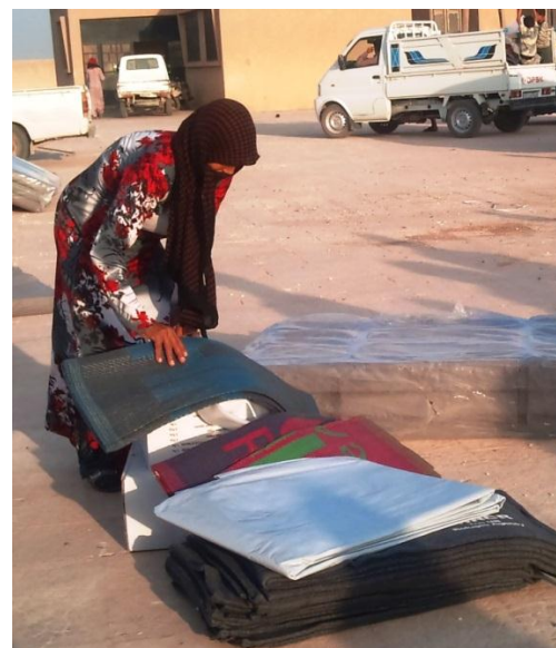
Credit: Syrian national NGO Rural Ar-Raqqa, Syria (14 Oct 2013). A national NGO partner distributes aid dispatched by international humanitarian agencies and organizations to men, women and children in need in the rural areas of Ar-Raqqa, where access for international humanitarian actors is constrained.

Following a temporary halt in assistance due to the disruption of network and bank capacity, UNHCR resumed cash-assistance distribution, in lieu of non-food items, to 47,328 people in Qamishli. It initiated a fourth round of distribution in Damascus.