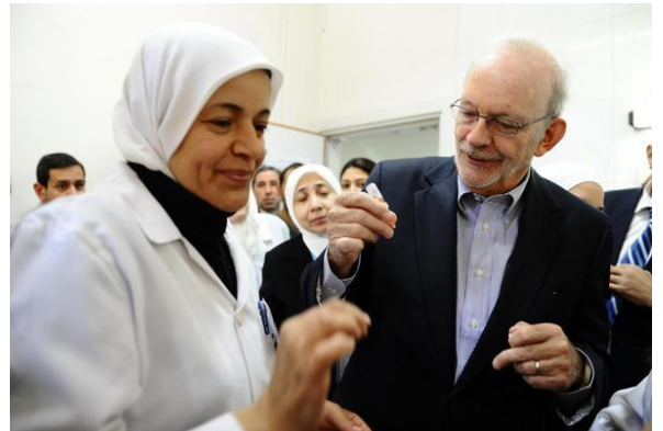
Damascus, Syria (29 Oct 2013) – A health worker shows UNICEF Executive Director Anthony Lake, holding a vial of oral polio vaccine, how to administer a dose, at Abu Dhar Al-Ghifari Primary Health Care Centre during the UNICEF-supported immunization campaign. All children coming to the health centre will be immunized against polio, regardless of previous vaccination doses received. Measles, mumps and rubella vaccines are also being administered to children not vaccinated during the last round of immunizations in March 2013.

The immunization campaign aims to administer vaccination doses to 1.6 million children under age 5 for polio, measles, mumps and rubella (MMR), as well as vitamin A supplements for children under age 5. Deir-ez-Zor is initially the priority area for the campaign, with the aim to contain the outbreak. Through SARC and private clinics, approximately 27,000 children under age 5 in Al-Maiadin district had received polio vaccines as of 2 November. Targeted media campaigns and messages are ongoing to build people's confidence in and compliance with the vaccination campaign. UNHCR has facilitated sensitization sessions regarding polio and available health services for more than 450 people, including women, children and displaced people, at its distribution centre for cash assistance in Damascus.