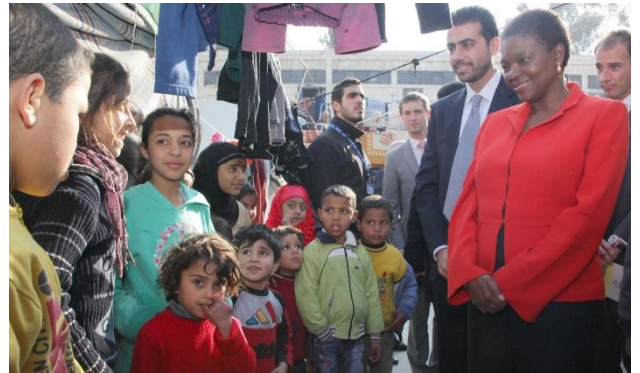
Jaramana, Rural Damascus (11 Jan 2014) – ERC Valerie Amos asks children about their days, which are spent in and around the collective shelter, including in one of three shifts of classes at the Al Rameh school.

The camp is already overcrowded with more Palestine refugees requiring shelter as the rates of displacement among the Palestine refugees exceed 50 per cent (270,000 people).