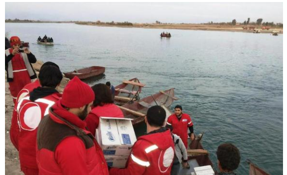
Credit: SARC Deir-ez-Zor/ Al Mayadin, Deir-ez-Zor (10 Dec 2013) – SARC volunteers go forward with a risky river crossing in order to reach children in Al Mayadin village with polio vaccines during the first round of ‘National Immunisation Days’ in December – administering the vaccine in this area is critical as the first cases were found in this village.

After confirmation of the outbreak of polio in October 2013, the Ministry of Health launched a response which targets 2.2 million children across all 14 governorates of Syria with repeated vaccinations monthly (December 2013 – May 2014) to contain the outbreak and prevent the of spread of the disease. This campaign is taking place in coordination with the massive regional campaign targeting 23 million children.