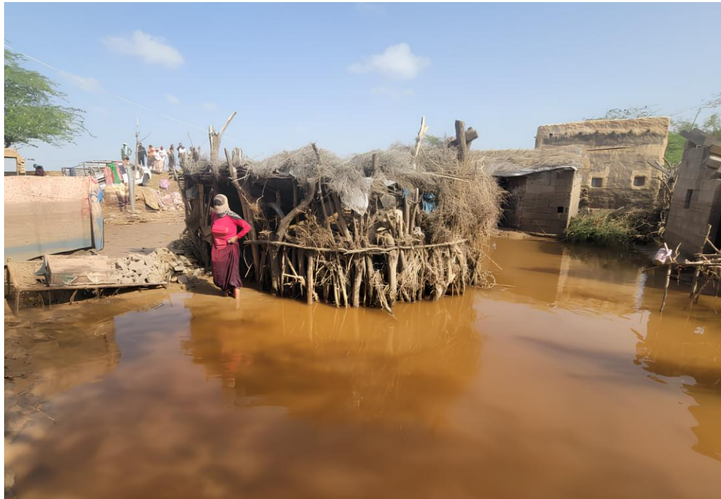
Family affected by flood in Al Mukha district, Taizz.