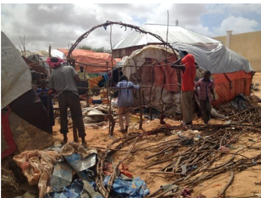
Figure 2 Rebuilding shelter after destroyed

The water reserves in Hodan, Wadajir, Waberi, warta Nabada and Bondhere severely affected the vulnerable Community and IDPs near that districts, as 8 children dead - 4 in Camp shabelle in Hodan Tarabun area, 3 in Daynile Mustaqiin camp and 1 in Huriwaa while two old houses fall down in Hamar Wayne and Huriwa but fortunately no one died or was wounds, in addition to that 27 of people obtained minor wounds during the evacuation. One of residents in Huriwa told to SWDC "Our clothes and bedding are all gone, some others are still floating on the water, we tried