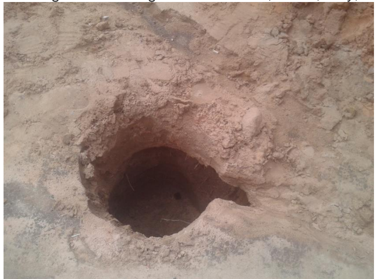
Figure 1 Destroyed Toilet

The Mogadishu rain affected 23 internally displaced people's settlements and vulnerable host communities in Mogadishu from different districts include Hodan, Waberi, Daynile, Dharkenley, Hamarwayne, Hamar jajab, Warta Nabada, Boondhee, Yakshid, Karan, Huriwaa and wadajir. An observation conducted by SWDC Field workers to determine number of people affected and lost in above districts.