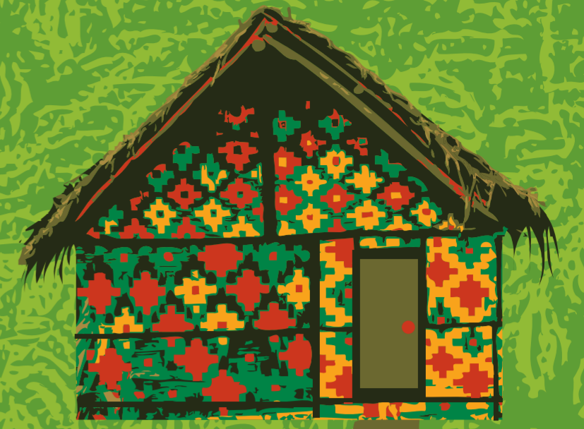
Natangura Metroxylon warburgii Rafta, Pelin, Ruf