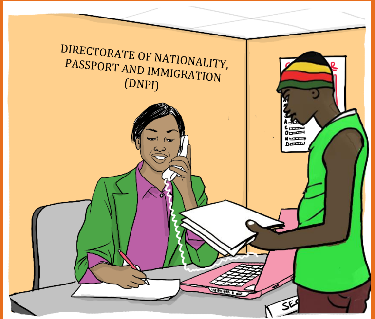
Returning the duly filled form with two passport size photos and a copy of your nationality certificate, a copy of your witness nationality certificate to the DNPI