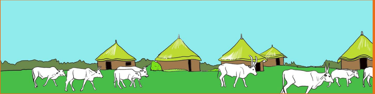
Grazing land dispute (on community land)