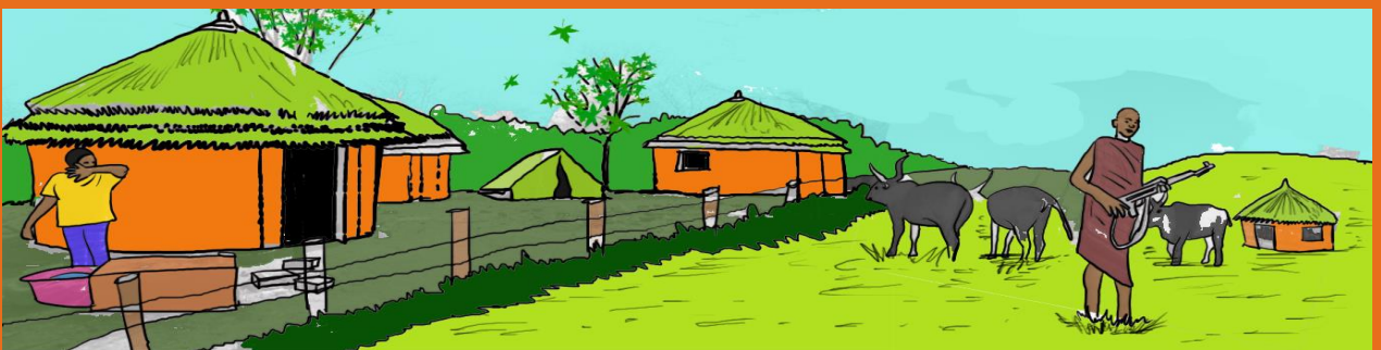
Boundary disputes (private plots and community land boundaries)