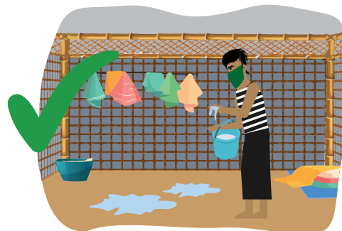
If you have sand flooring, spill some water on the floor and wet the brush before sweeping the floor. Sweep gently trying not to lift sand and dust. Let it dry completely