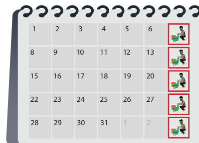
Clean the shelter regularly and at least every week

All kind of humanitarian aid is free. No sexual or other favor can be requested in exchange of humanitarian assistance. Any case or suspicion of sexual exploitation and abuse by UN or humanitarian workers can be reported to the complaint desk.