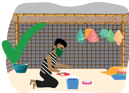
If you have cement flooring, mix some laundry soap in a bucket with water and wet the floor; then sweep with a cloth or brush. Let it dry completely