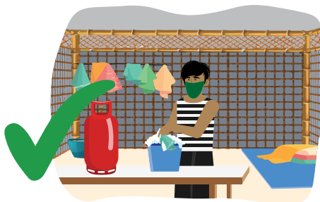
Wet a cloth with clean water and soap to clean the surfaces