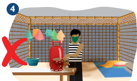
Do not dry dust any surface of the shelter. If the virus is on the surface you may be spreading it