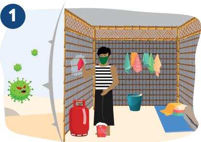
Keeping your shelter clean will help reducing the spread of the virus

Recommendations to minimize the spread of COVID-19