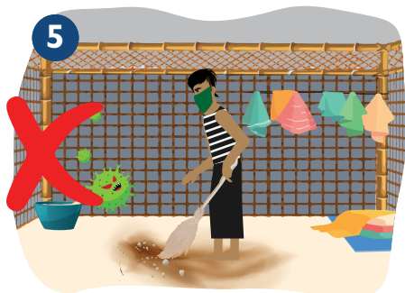
Do not dry sweep the floor as you may be spreading the virus