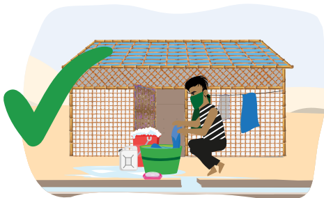
Wash the tarpaulin outside the shelter, close to a drainage channel. Wash it with laundry soap and clean water and rinse it. Sun dry the tarpaulin hanging it outside your shelter