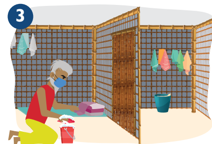
The person that is physically distancing from other family members should only clean his/her room