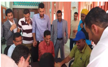
SMC Training session for Partners and the local authority in Hajjah Governorate.