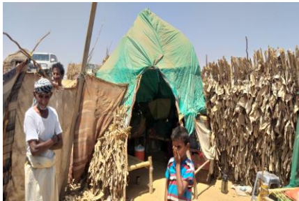
Shelter condition for newly displaced families fled the fighting in Hajjah and resided in IDP hosting sites.