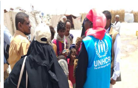
Interaction with the local authority and partners at Al Gaisha IDP Hosting Site at the West Coast.

CLUSTER PARTNERS – 90 # OF IDPS IN SITES – 1,340 IDP HOSTING SITES – 432,179 people