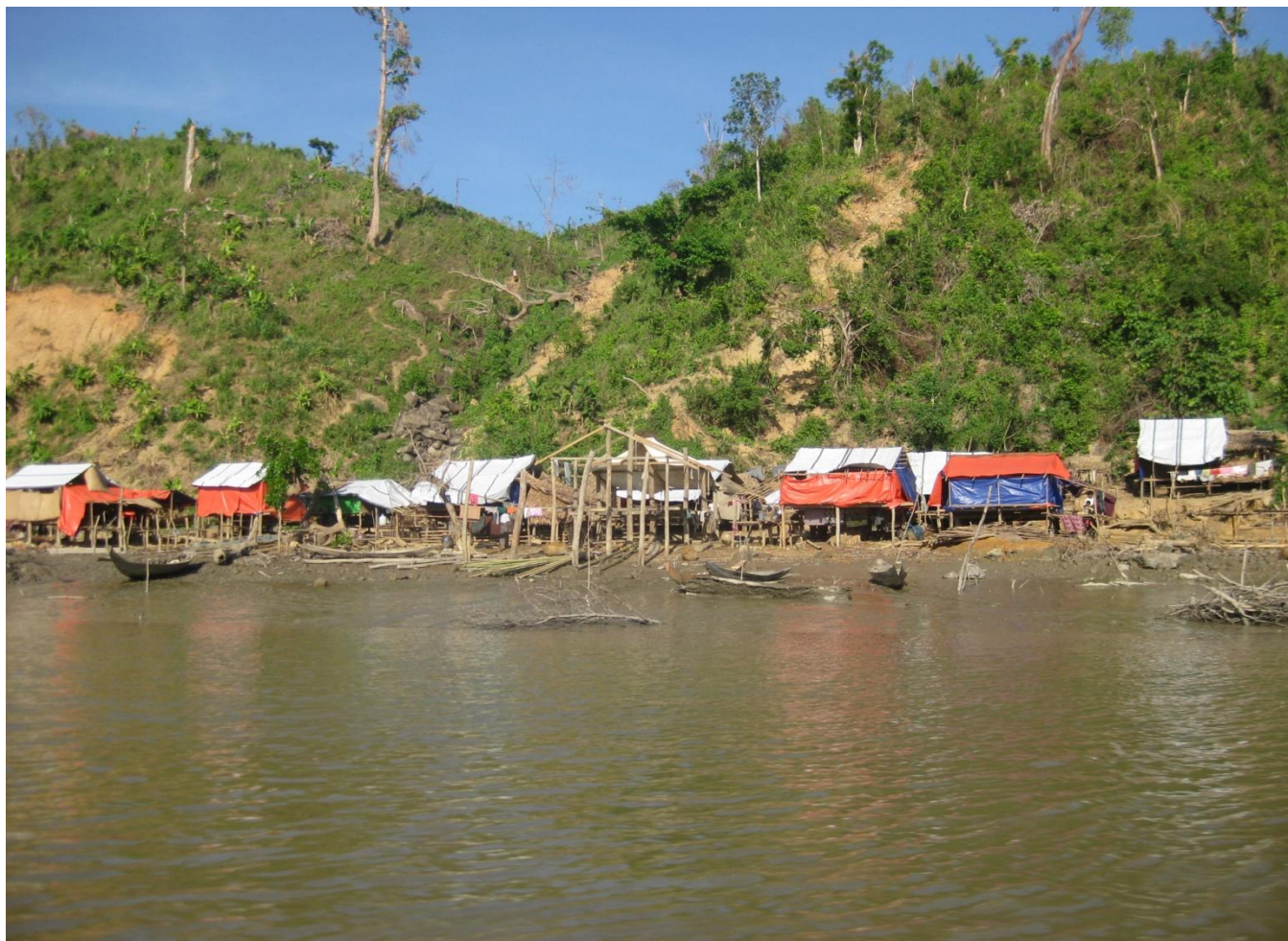
The Rakhine Coast One month after Giri.