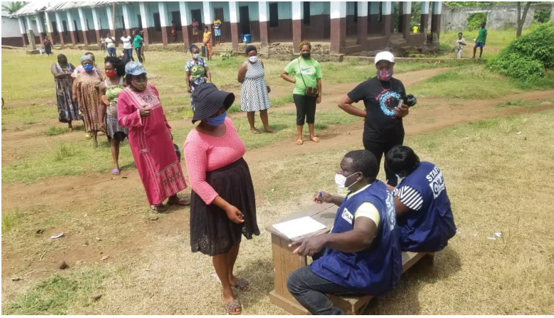
Shutsi F. Plan International/UNHCR, 06/2020