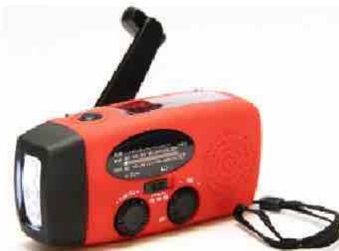
Hand Crank Radio