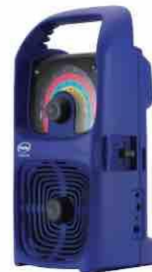
Solar Radio for neighborhood