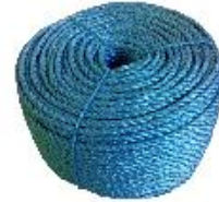
Rope ( \Phi 3mm)