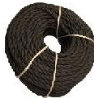
Rope ( \Phi 6mm)