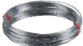
Tie Wire ( \Phi 1.5mm)