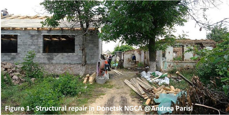
Figure 1 - Structural repair in Donetsk NGCA

TECHNICAL NOTES - In May, the Cluster has organised a one-day workshop, to agree among shelter partners on three typical situations faced by shelter agencies in their daily activities: houses that have already been repaired but require further shelter assistance; acceptable percentages of failure in shelter assistance; assistance to households who do not own the house in which they live. The first two situations are now regulated by two Technical Notes that will soon be available on the Shelter Cluster website. The third topic has been referred to the HLP (House, Land and Property) technical working group who's expected to issue soon a guidance note.