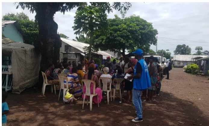
NFI Kits Distribution SW Region: ©UNHCR August 2019