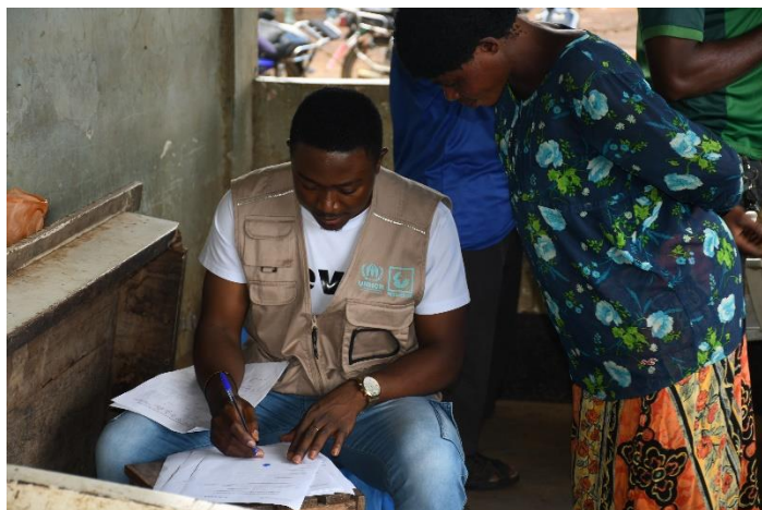
NFI Kits Distribution SW Region: ©UNHCR October 2019