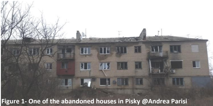
Figure 1- One of the abandoned houses in Pisky