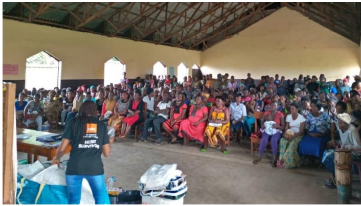
NFI Kits Distribution NW Region: ©NRC 2019