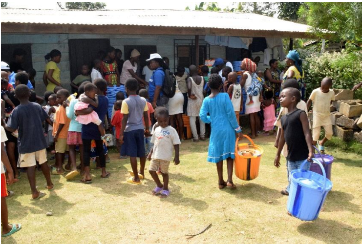
Children receiving NFIs in Kumba, SW Region: ©Plan 19