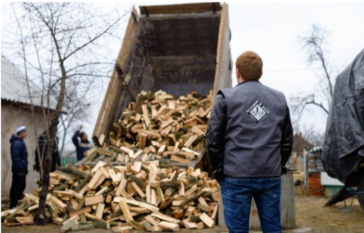
Krasnohivka, 17 November 2015