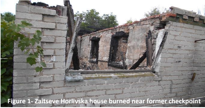
Figure 1- Zaitseve Horlivska house burned near former checkpoint