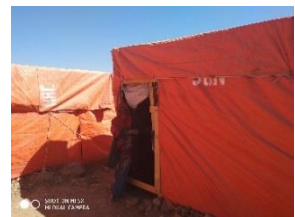
An elderly woman interviewed