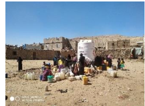
Water collection point in the site