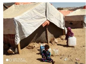
Children carrying water