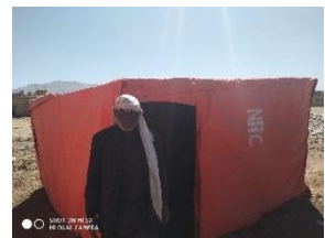
Upgraded shelter in the site