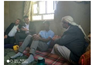
Discussion with IDP renting an apartment next to the site

Detailed minutes is provided in Annex 2.