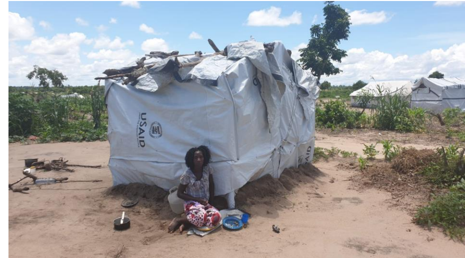
Emergency shelters in Nhamatanda, some days after the floods end February 2020