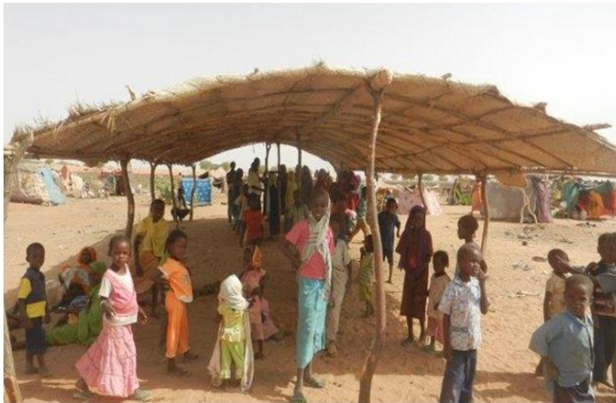
A UNHCR Communal Shelter, Kass Rural , South Darfur