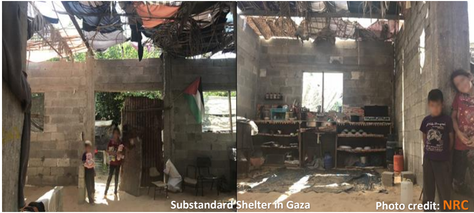
Substandard Shelter in Gaza