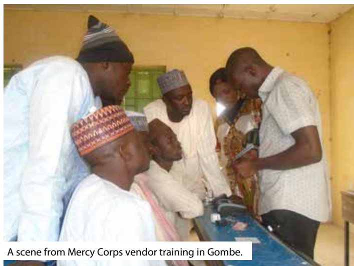
A scene from Mercy Corps vendor training in Gombe.