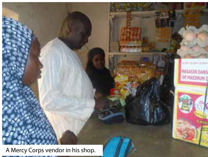
A Mercy Corps vendor in his shop.

As the ONESystem tracks and records every transaction, Mercy Corps can easily evaluate the programme's impact. Through the dedicated monitoring and evaluation function of ONESystem, Mercy Corps has real-time data about ongoing purchases, market prices and the buying preferences of beneficiaries. This helps Mercy Corps monitor and keep its programme relevant and fit for purpose. The ONESystem also allows flexibility to make changes in the project when necessary. Furthermore, this real-time information enables Mercy Corps to clearly demonstrate the project's impact to its donors with greater accountability.