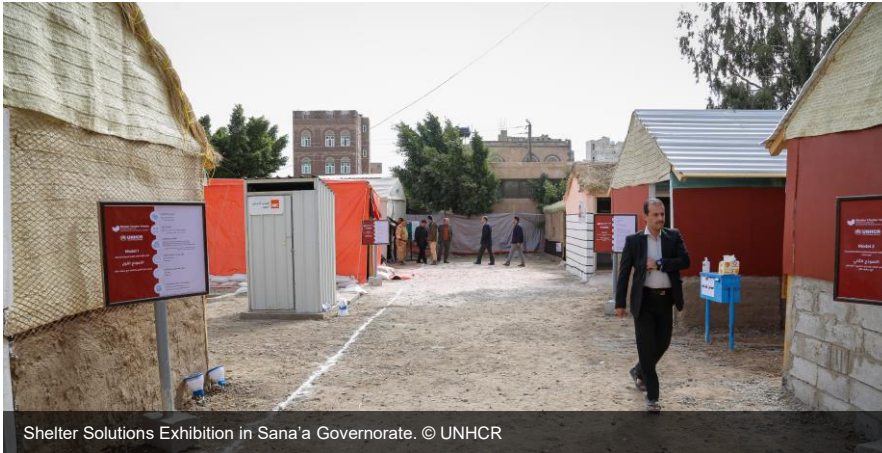
Shelter Solutions Exhibition in Sana'a Governorate.