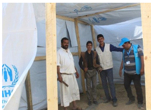
Partners in Sa'ada during the training