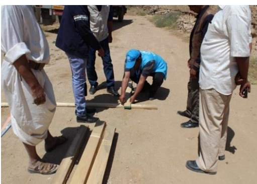
Set-up of an Enhanced Emergency Shelter Kit (EESK)

Email: co-chair.yemen@sheltercluster.org