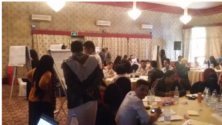
Shelter/NFI/CCCM Cluster—NGOs working Session in Sana'a