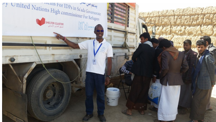
Distribution of NFI (Non– Food Items) in Sa'ada Town by UNHCR

On the second day some 35 Partners and representatives of WASH and Protection Clusters discussed on the Shelter/CCCM/NFI Cluster priorities for the Humanitarian Response Plan (HRP) 2018, on how to better coordinate activities, strengthen the Protection and Gender mainstreaming in Cluster response, and fulfil the Clusters AAP (Accountability to Affected Populations) commitments. The Ministry of Foreign Affairs and the Executive Unit were also represented.